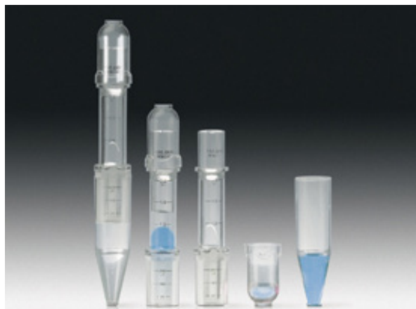
Vivaspin® 2mL, image courtesy of Vivaproducts

Vivaspin® Concentrators are disposable ultrafiltration devices that may be utilized for the washing and concentration of submicron (20 nm - 0.5µm) microspheres. Vivaspin® present an excellent (fast, easy, economical) alternative to dialysis or more laborious/wasteful filtration devices.